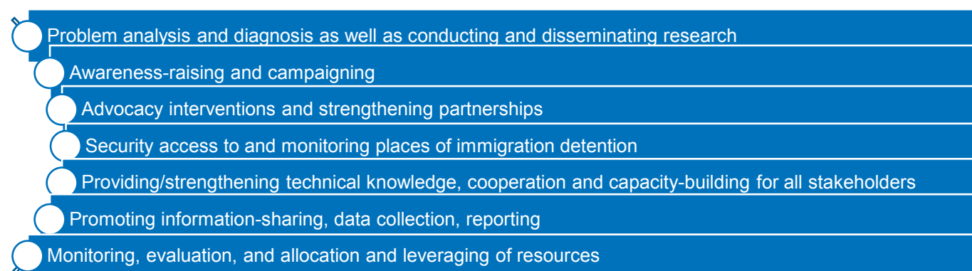
Figure 1: Elements contained in a national action plan

In the first two years of the GSBD (2014–2016), it was rolled out to 12 countries selected on the basis of a set of criteria, including regional and thematic diversity, size and significance of the problem, likelihood of making an impact, as well as staffing and resources. 15 By the end of the five-year strategy period, it was rolled out to a total of 20 countries (hereafter “roll-out countries”). 16 In the spirit of transparency, UNHCR made the action plans that were developed for most of the roll-out countries and the progress reports publicly available on its website.