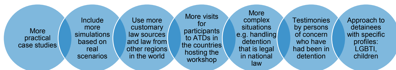
Figure 3: Recommendations for improvements by graduates of learning programmes 53

However, the review notes that some adjustments need to be introduced in the future to these learning programmes to ensure that they continue to be relevant and effective. These are summarized below: