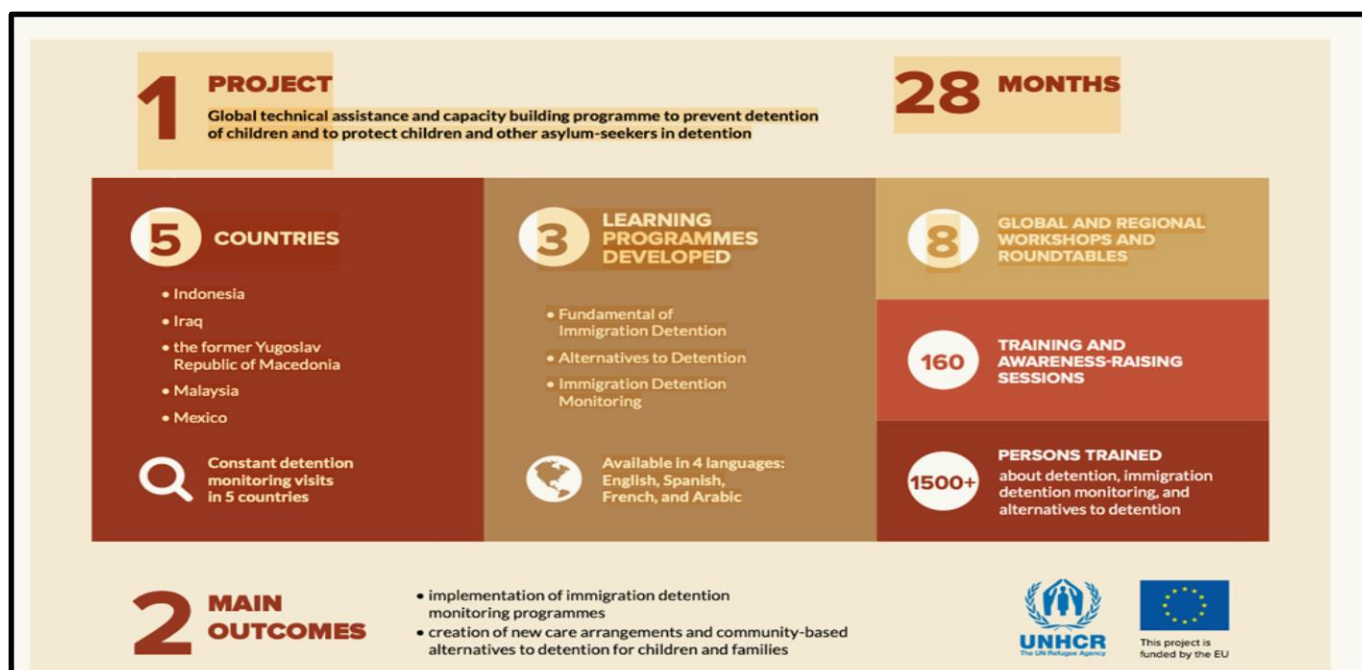
Figure 4: Overview of the EIDHR project 56

The regional roundtables organized by UNHCR and its partners over the years and dealing with specific issues also offered important avenues of learning and capacity-building. As noted in the KIIs and the survey, the newly acquired knowledge and tools prompted some partners to become allies or champions for the GSBD in their own organizations and institutions.